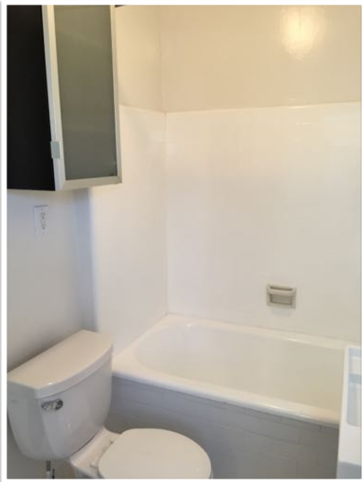
The bathroom with a soaking bathtub and shower...