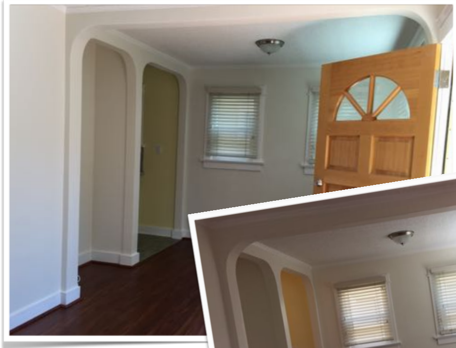
Opening the front door & both ends of living room...