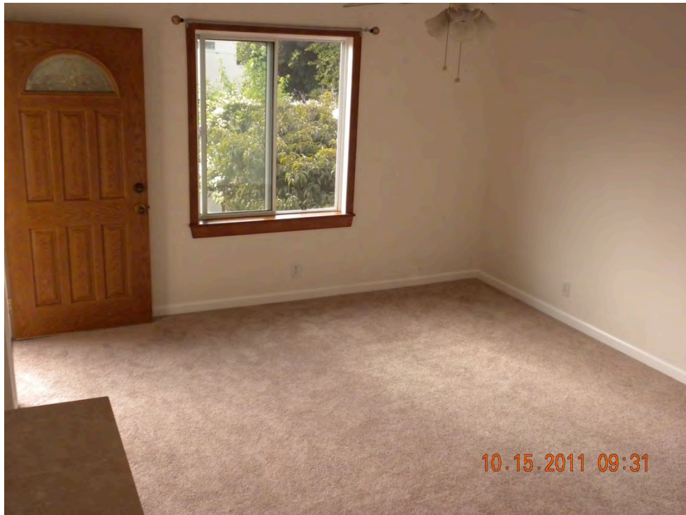
Another window facing West...